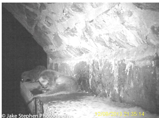
© Jake Stephen Photography 12/08/2013 21:35:14

These photographs have been kindly provided by Jake Stephen. The photograph above shows when the otters were going upstream and the photograph below a few days later when they were coming back downstream