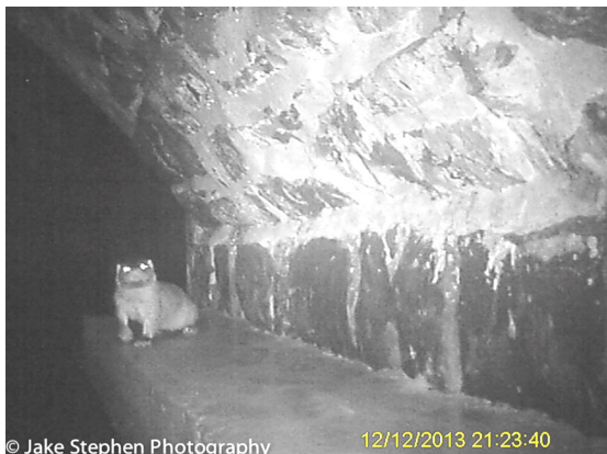
© Jake Stephen Photography 12/12/2013 21:23:40

These photographs have been kindly provided by Jake Stephen. The photograph above shows when the otters were going upstream and the photograph below a few days later when they were coming back downstream